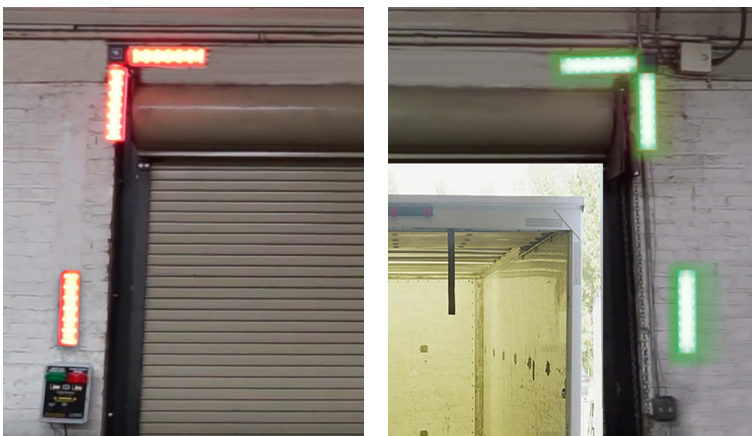
TopDok turns from red to green when a loading vehicle is properly restrained.