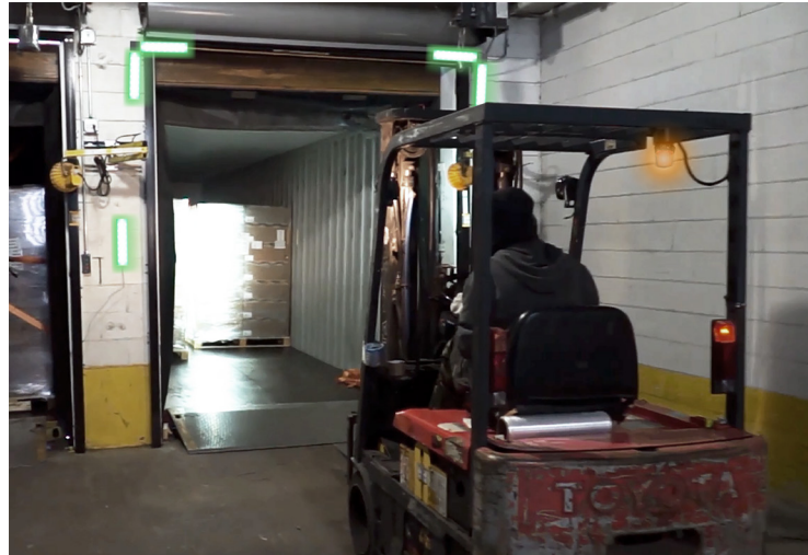
TopDok shown with Tri Lite's dock light and lift-truck warning light.

Choose between a set of corner lights that are installed above the dock door header, or a singular linear light mounted beside the door opening. Use both for full-coverage signaling that reduces the risks of accidents.